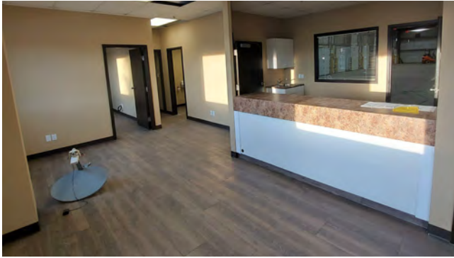
Office / Cross Dock Loading Area